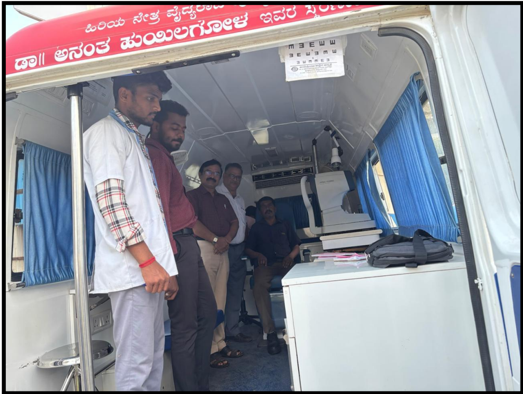
DATE: 24.12.2024 – FREE EYE CHECKUP AND FREE CATARACT EYE SURGERY CAMP FOR LABOURS WITH THE ASSOCIATION OF FASTNERS AND ALLIED PRODUCTS PVT. LTD. HUBBALLI AND JAYAPRIYA EYE HOSPITAL, HUBBALLI AT INDUSTRY