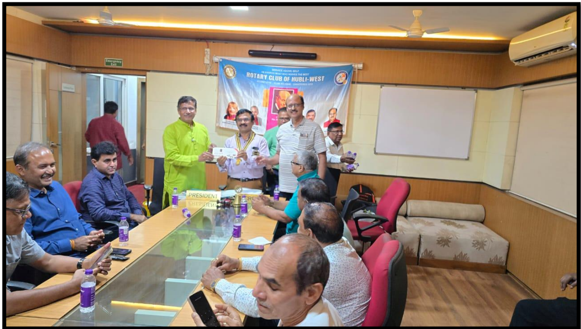
DATE: 27.12.2024 – THIRD GENERAL BODY MEETING WAS CONDUCTED AT FASTENERS AND ALLIED PRODUCTS PVT. LTD., INDUSTRIAL AREA, GOKUL ROAD, HUBBALLI