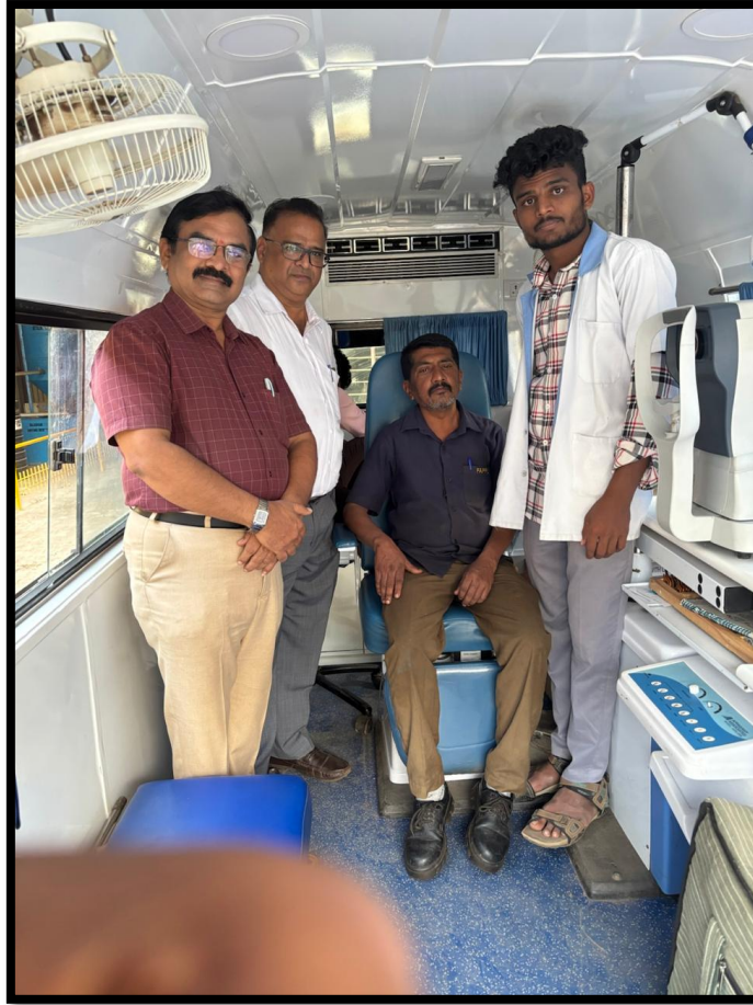
DATE: 24.12.2024 – FREE EYE CHECKUP AND FREE CATARACT EYE SURGERY CAMP FOR LABOURS WITH THE ASSOCIATION OF FASTNERS AND ALLIED PRODUCTS PVT. LTD. HUBBALLI AND JAYAPRIYA EYE HOSPITAL, HUBBALLI AT INDUSTRY