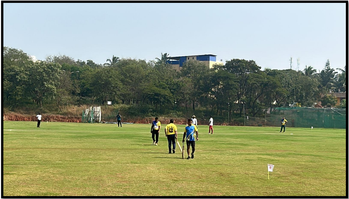
DATE: 04.12.2024 – OUR CLUB MAGICIANS ACTIVELY PARTICIPATED IN REVENUE SPORTS MEET CONDUCTED BY RC MIDTOWN AT HUBBALLI