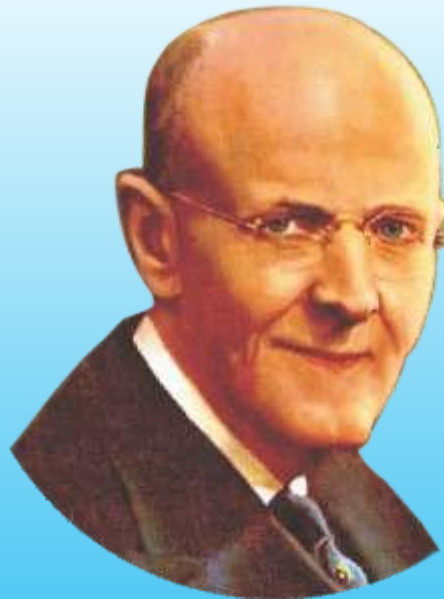
Founder Rtn. Paul P. Harris

R. I. Dist.: 3170 Club No.15648 Chartered: 23-Feb 1972