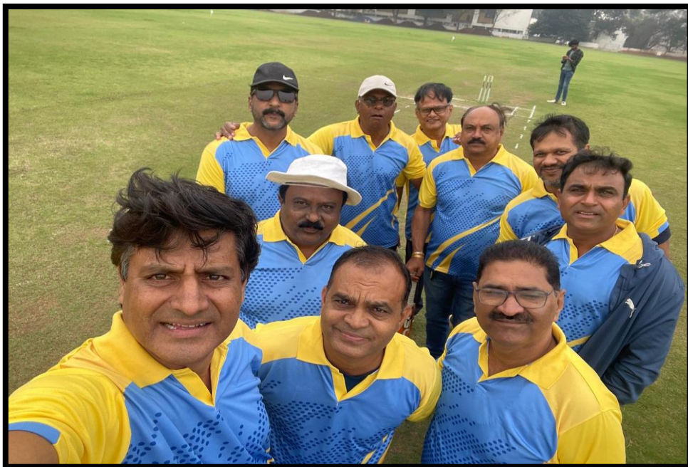
DATE: 04.12.2024 – OUR CLUB MAGICIANS ACTIVELY PARTICIPATED IN REVENUE SPORTS MEET CONDUCTED BY RC MIDTOWN AT HUBBALLI