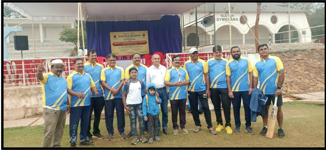
DATE: 04.12.2024 – OUR CLUB MAGICIANS ACTIVELY PARTICIPATED IN REVENUE SPORTS MEET CONDUCTED BY RC MIDTOWN AT HUBBALLI