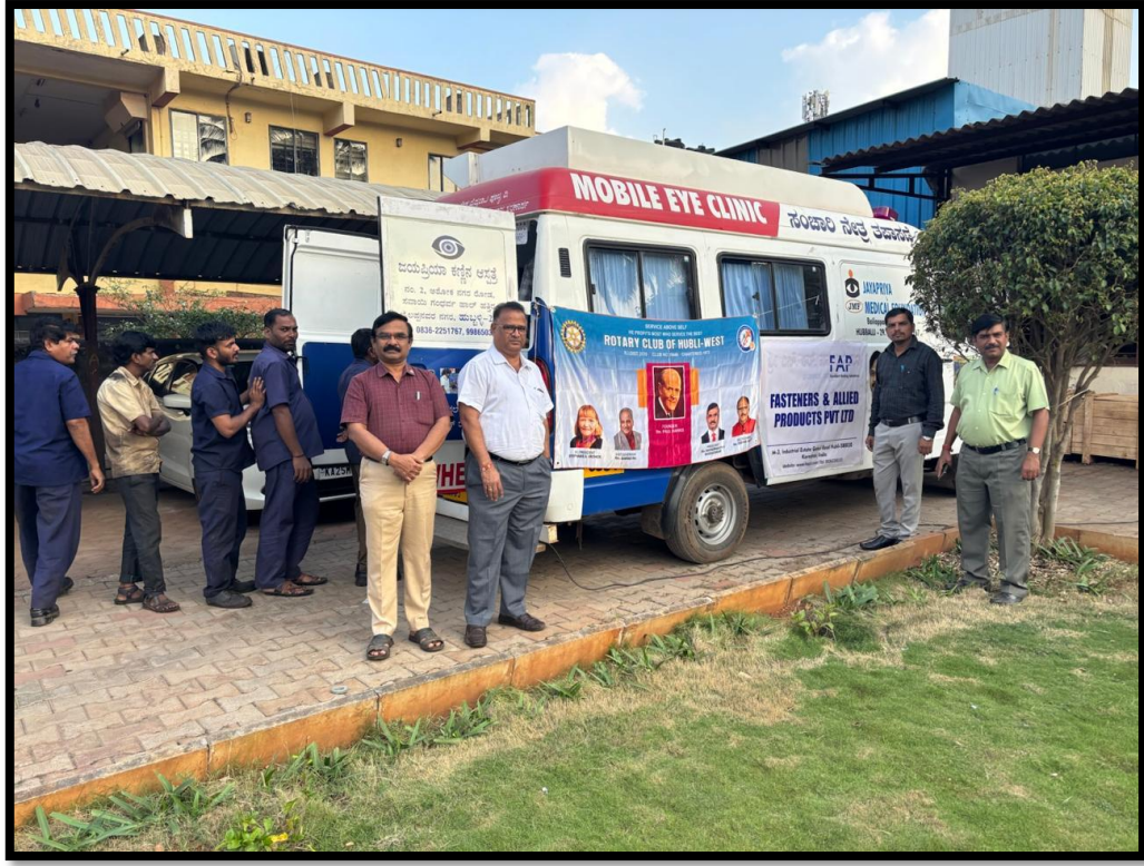
DATE: 24.12.2024 – FREE EYE CHECKUP AND FREE CATARACT EYE SURGERY CAMP FOR LABOURS WITH THE ASSOCIATION OF FASTNERS AND ALLIED PRODUCTS PVT. LTD. HUBBALLI AND JAYAPRIYA EYE HOSPITAL, HUBBALLI AT INDUSTRY