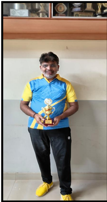
DATE: 04.12.2024 – OUR CLUB MAGICIANS ACTIVELY PARTICIPATED IN REVENUE SPORTS MEET CONDUCTED BY RC MIDTOWN AT HUBBALLI