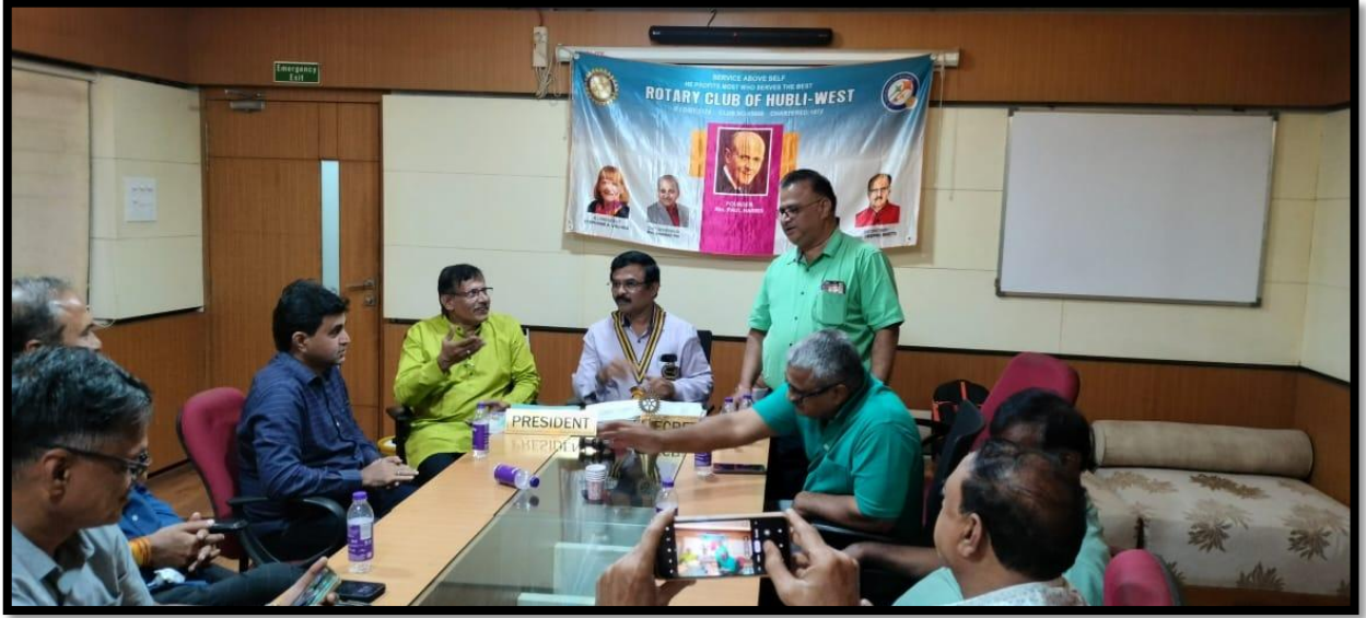
DATE: 27.12.2024 – THIRD GENERAL BODY MEETING WAS CONDUCTED AT FASTENERS AND ALLIED PRODUCTS PVT. LTD., INDUSTRIAL AREA, GOKUL ROAD, HUBBALLI